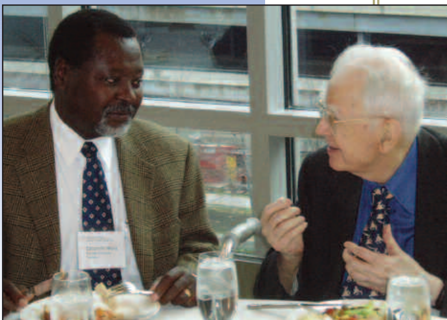
Ronald Coase discusses research informally over lunch at a conference on transaction costs, organized in Chicago by the Coase Institute.