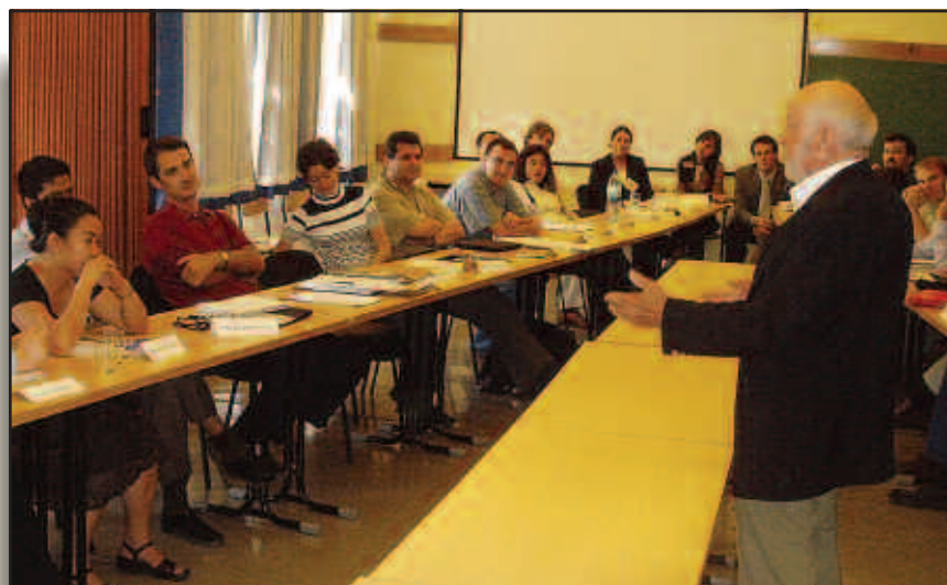
Douglass North lectures on cognitive science and economics during a Coase Institute workshop.

The Coase Institute is distinct because it focuses on the impact that institutions have on economies and does it in a rigorous, translatable way.