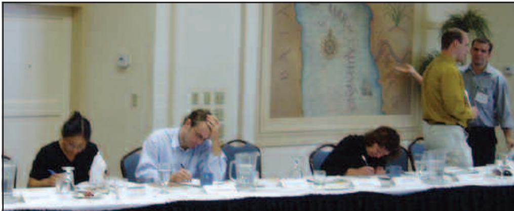
Scholars who might otherwise never get the chance to meet can work together during and after Coase Institute workshops, as here in Tucson.

Graduates of our workshops have also had excellent success with scholarly research and activities. In worldwide research competitions conducted by the Global Development Network, our graduates in Russia, Argentina, and India have won four major prizes, while another in Nepal was a top-three finalist. The Economist magazine featured a study on child mortality and water supply by a workshop graduate in Argentina. A Russian graduate has been a Fellow at the Institute for Advanced Studies, Princeton. Another Russian graduate won the prize of the Central Mathematics and Economics Institute in Moscow. Two Hungarian graduates are founders of the Hungarian Society for New Institutional Economics. Many are publishing books and articles in scholarly journals. At least ten graduates have returned to serve as faculty in later workshops, helping to educate other young scholars.