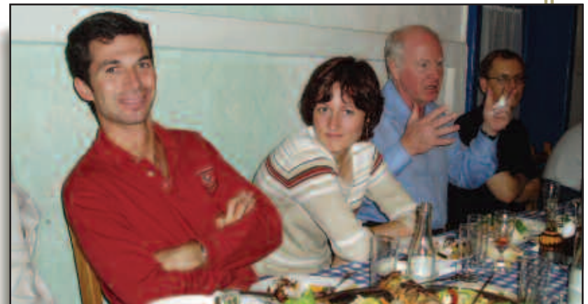
Coase Institute activities help young scholars build professional relationships within a strong network of beginning and established scholars.